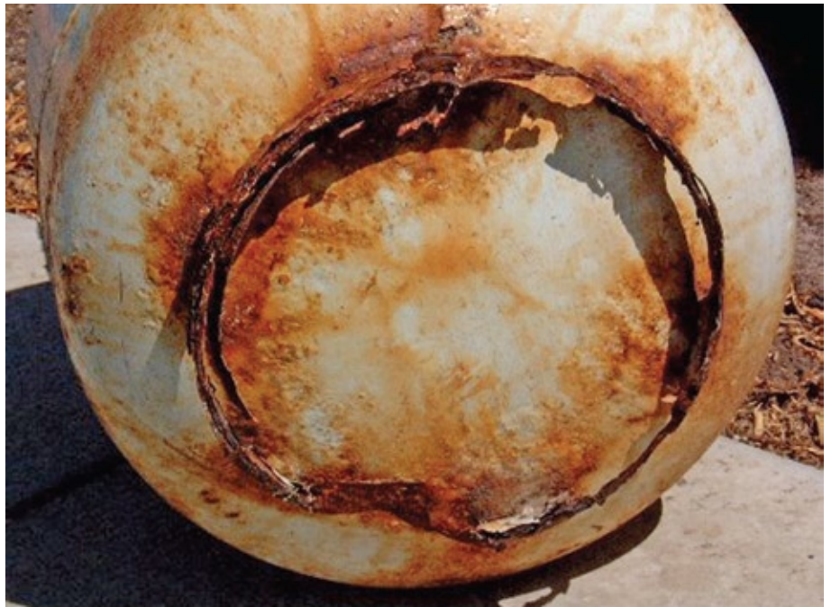
Fig. 4.3 Poorly maintained cylinder steel LP Gas cylinder with a badly corroded base - a potential safety hazard