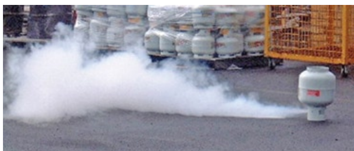
Fig. 2.1 In vapour state, LP Gas is heavier than air and tends to settle down