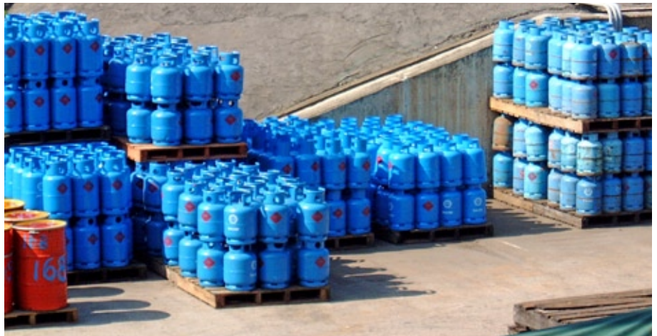
Fig. 4.4 Storage of LP Gas cylinders in pallets