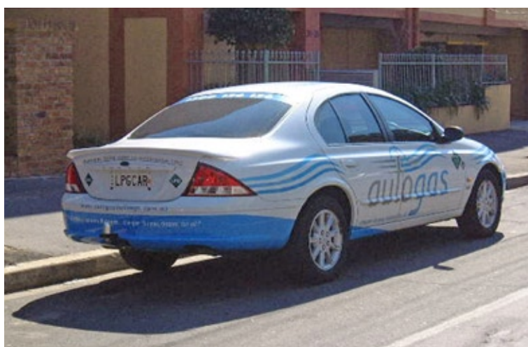
Fig. 2.2 LP Gas is a popular alternative automotive fuel in many markets across the world