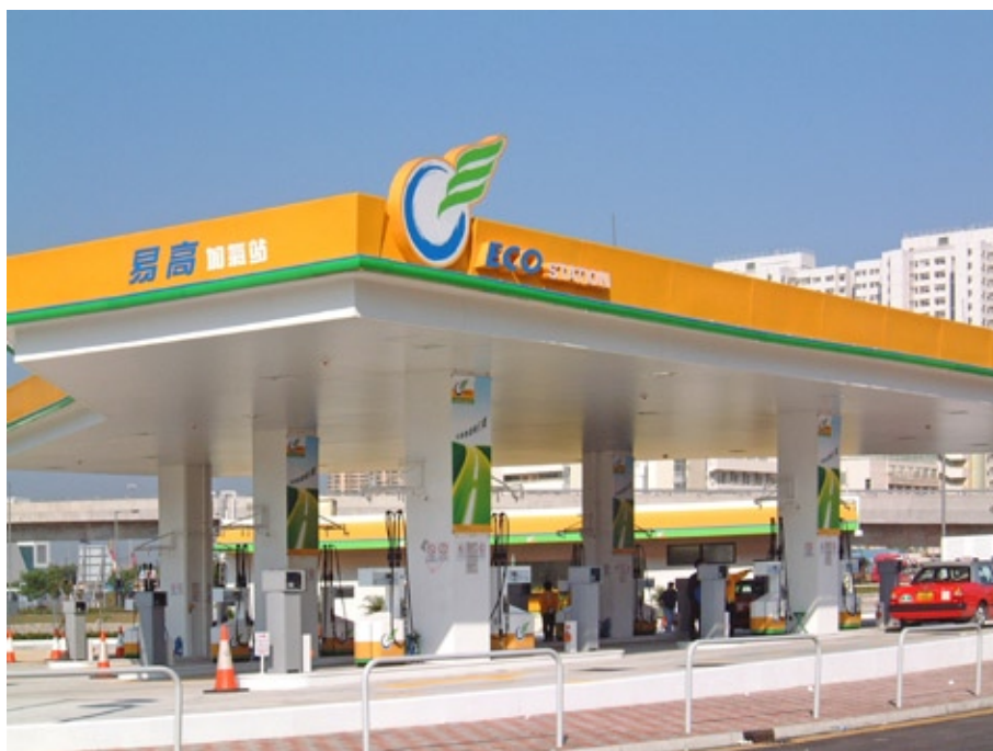
Fig. 4.1 Like gasoline and diesel, Autogas is dispensed to vehicles through retail stations in a safe and convenient manner