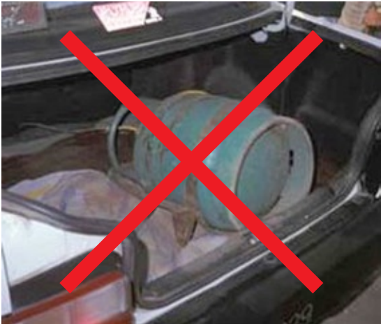
Fig. 4.4 Removable LP Gas cylinders as source for automotive fuel should not be used in vehicles