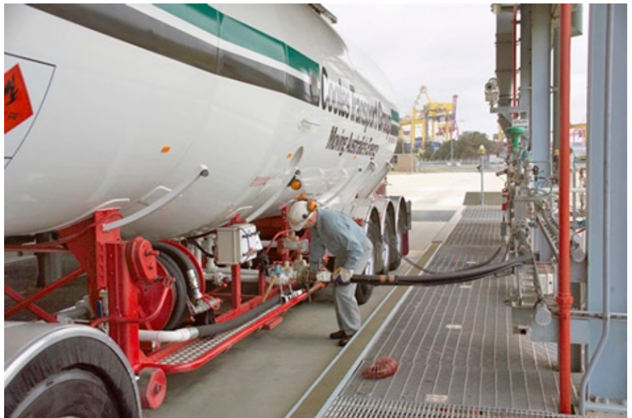
Fig. 4.2 A bulk LP Gas road tanker under filling at an LP Gas Depot